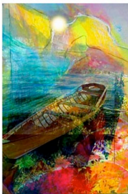
Between boat red / Series Innere Topo.Grafik £ 700